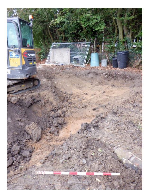
Plate 4. View of site reduction (looking W)