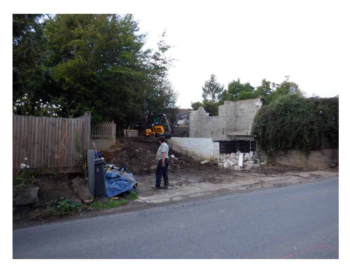
Plate 1. View of the site (looking NW)