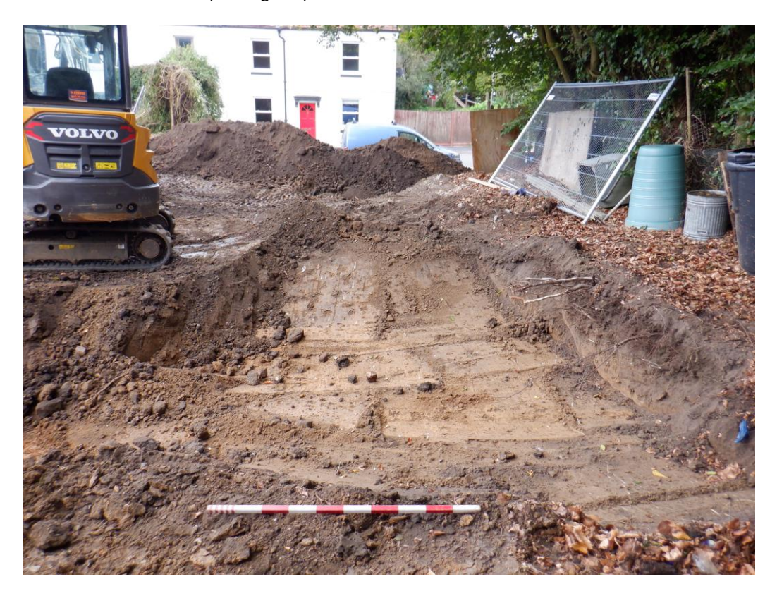
Plate 2. View of site reduction in progress (looking N)