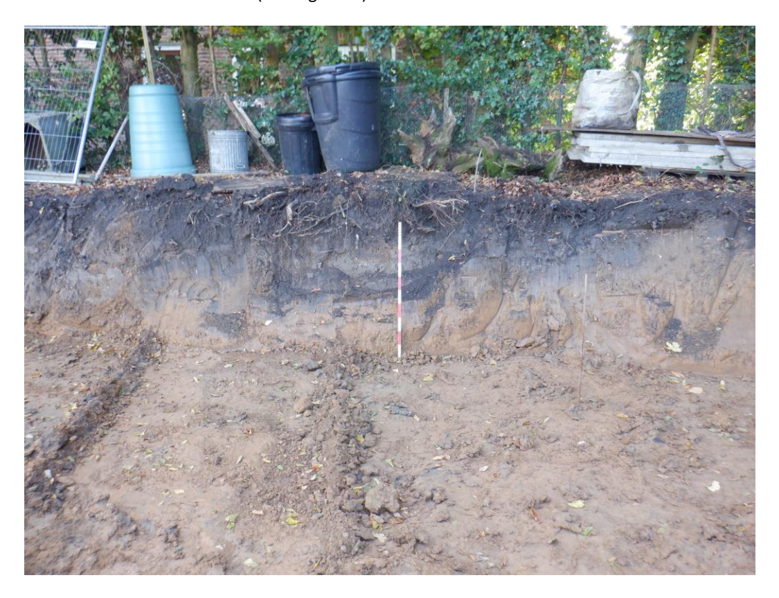
Plate 6. Site reduction completed (looking S)