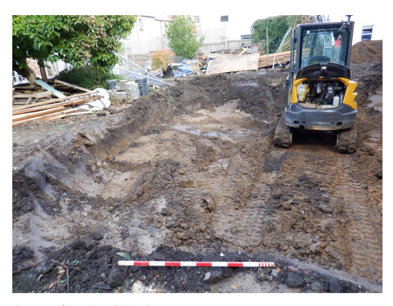
Plate 3. View of site reduction (looking S)