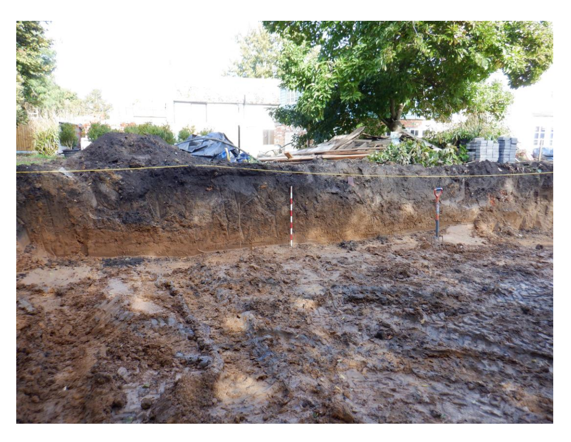
Plate 5. View of excavated site (looking NNW)